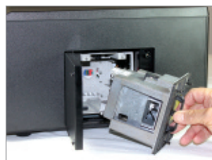
Easy to change long-life lamp.