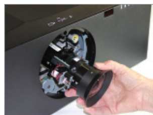
Easy to change lenses.