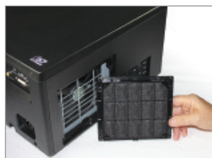
Handy access to air filter.

Includes a full complement of connections, including network control.