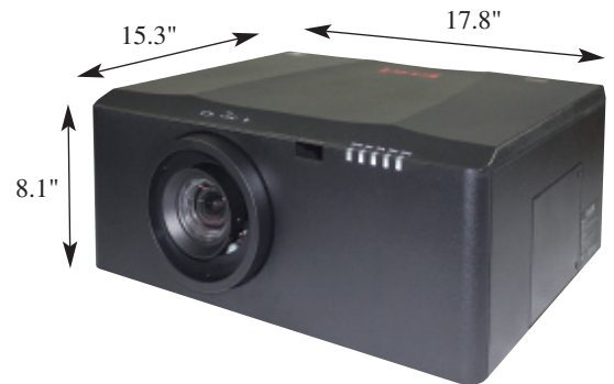
EK-612X • XGA • 1-chip DLP® projector.